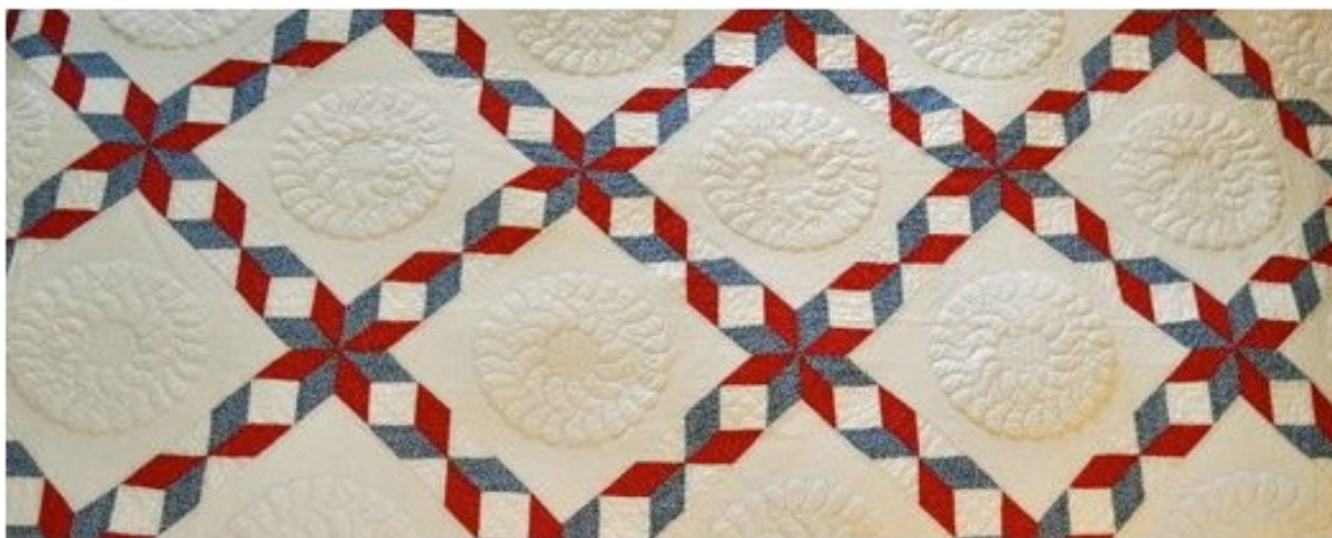
Sonhild Rodney, Detail of hand-quilted bed quilt

Sonhild takes a traditional approach to quilting, finding peace and comfort in hand piecing, hand appliquéing and hand quilting. She typically makes quilts for use on beds rather than walls, giving most of what she makes away to friends and family.