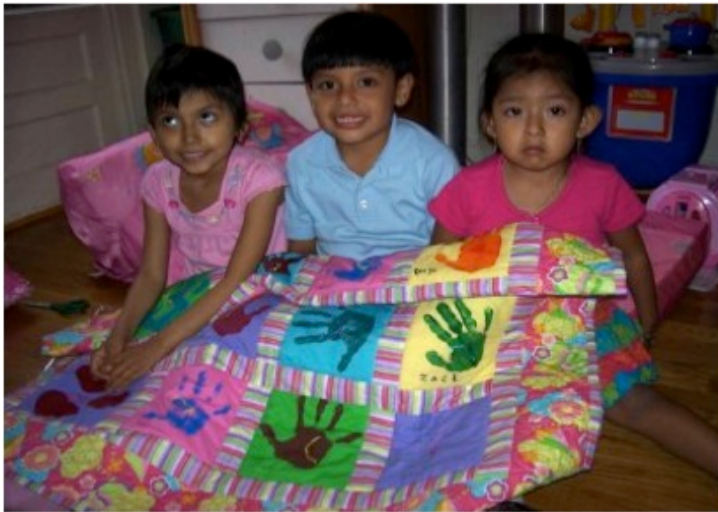
A delighted recipient (left) shares her quilt with two cousins