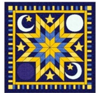
Luann Bruce, quilt designed with EQ7

Bring a laptop with EQ loaded and activated. You also will need a mouse and extension cord.