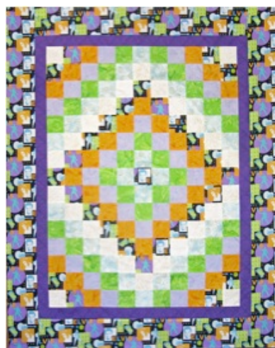
Maria Weinstein, King of the Whole Wide World , 2011.

Come create a lap-size (45 x 60") trip-around-the-world quilt. This is a great technique for recreating an old-time favorite. Traditionally made from individual squares, this method uses all strips. This makes it faster and easier to complete in eight hours. The course level is from advanced beginner to intermediate.