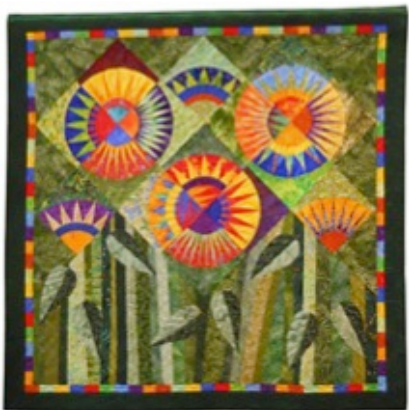
Eunice Gough, Fantasy Garden

Whether it's an illness, condolence, marriage, baby, or just a need for encouragement, please drop me a note.