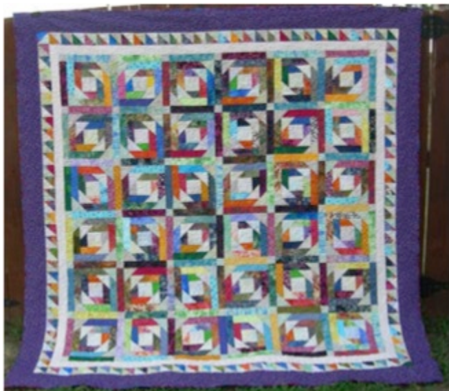
Bonnie Hunter, Pineapple Blossom