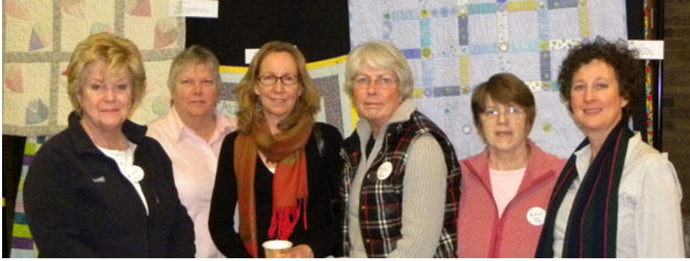
New members at the January Guild meeting.